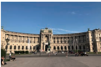
Hofburg Palace of Habsburg

Elisabeth A. Eugenie known as Sisi is also famous for her love for sweets. She married Franz Joseph I of Habsburg at the age of 16, during the 19 th century. However, she often escaped hard life at the palace to travel around Europe, visited cafés and enjoyed delicious sweets. Her favorites were sugarcoated violets and various kinds of tortes.