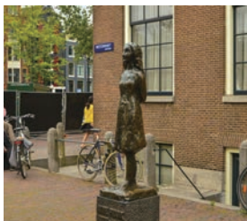
the statue of ( )