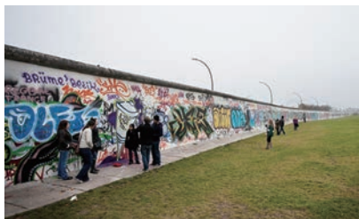
the Berlin ( )