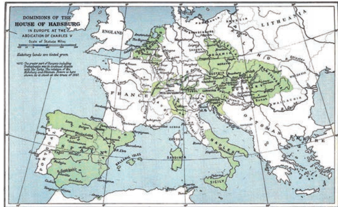
The territories of the House of Habsburg in 1547

The House of Habsburg in Vienna was chosen for the Emperor of the Holy Roman Empire in the 13 th century, and maintained political power until the 20 th century. Their influence was not limited to political issues, but also extended into other areas, including sweets.