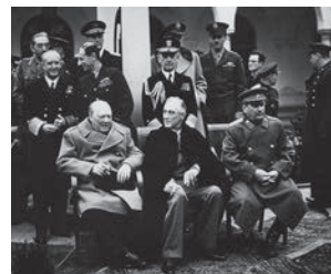
the ( ) Conference