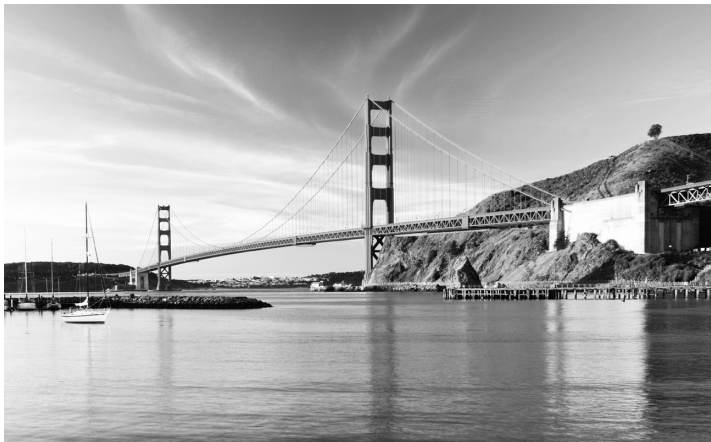
Golden Gate Bridge, San Francisco