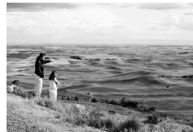
Grand View of the Eastern Washington Palouse Region