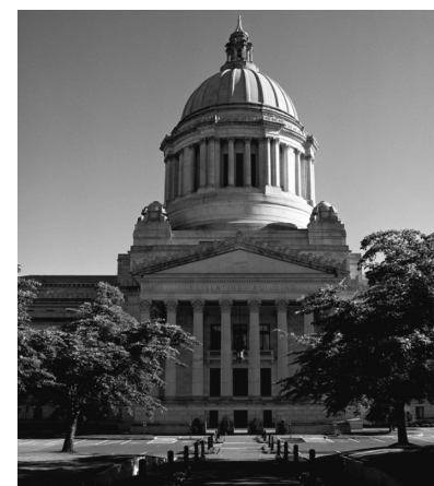
Washington State Legislative Building in Olympia